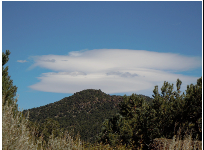
Not all was lost...the temperature was good and the skies were beautiful.