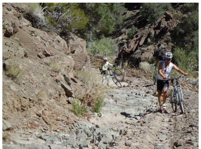
Flooding had obviously turned part of the road into a dry stream bed....surely that wouldn't go on for long.... We thought about retreat, but it just isn't in our nature....