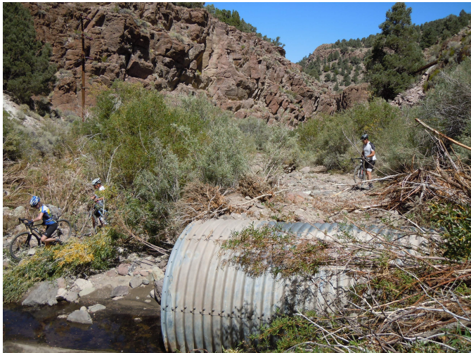
Even giant culverts had been washed out. We couldn't agree on how many miles of this stream bed we walked, but I'd guess 6 miles. It was enough to make the intermittent deep sand of the next 8 miles into Bodie look really good.