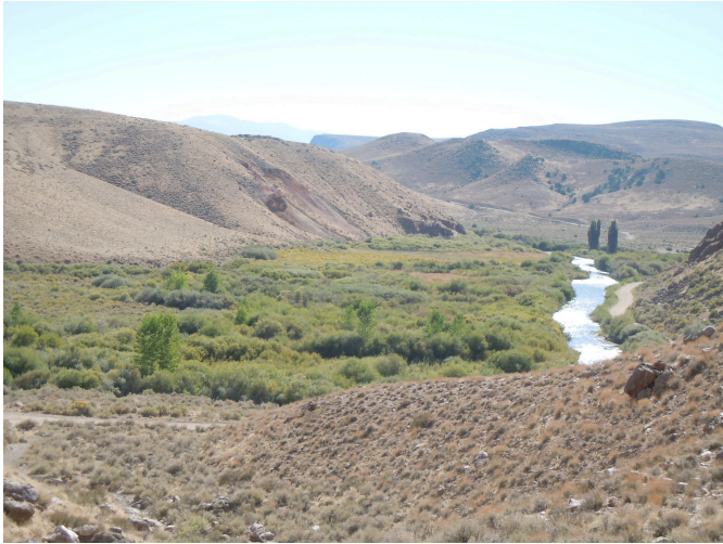
The once enjoyable "Bodie or Bust" ride begins on a NF028 between Hwy 382 and the town of Hawthorn. The East Walker River flows through this area providing year around fishing and wild life habitat.