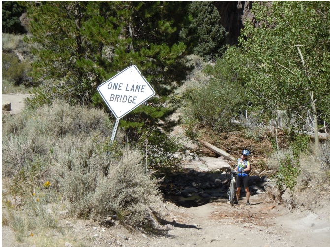
A bridge that had been made out of sections of railroad track had been completely washed away.