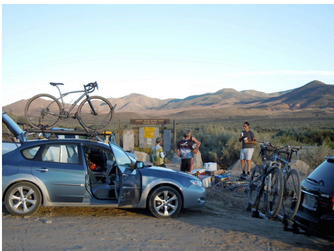
We returned from Bodie via paved roads rather than risk getting caught on more washed out roads. A head wind that had plagued us for a couple hours shifted and made our last 15 miles of this 69 mile ride swift and enjoyable as we watched the shadows getting longer.