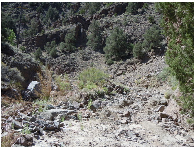
A couple miles past the stage coach stop we turned south toward Aurora and soon entered Del Monte Canyon, which follows Bodie Creek. The road through this canyon is well over 100 years old and until this year had been a little rough but enjoyable.