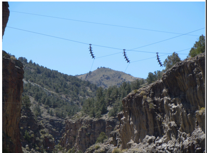
Power lines through Del Monte canyon provide some small hope that the road might be rebuilt.