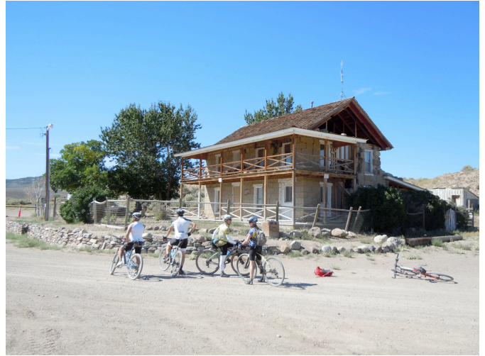
A stage coach stop, from the early Esmerelda mining days is still standing at about the 13 mile mark along NF028. The building suffered structural damage in 2017, but it appears that there are some efforts to protect it now.