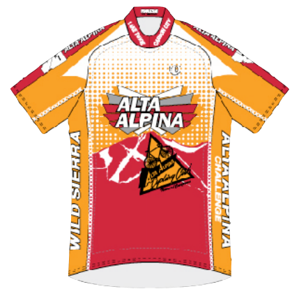
Red and Orange: Order from inventory. https://www.altaalpina.org/clubkit/