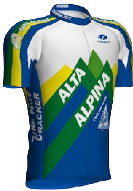
Yellow and Blue: Order from inventory. https://www.altaalpina.org/clubkit/