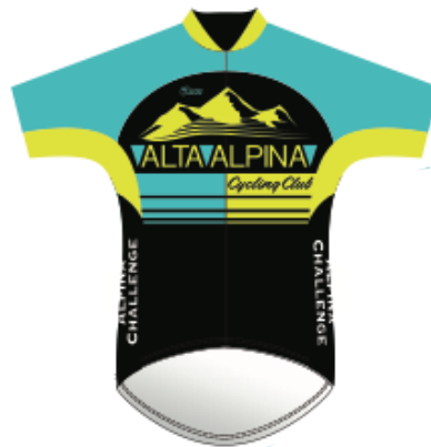
Fashion Kit: Order from inventory. https://www.altaalpina.org/clubkit/