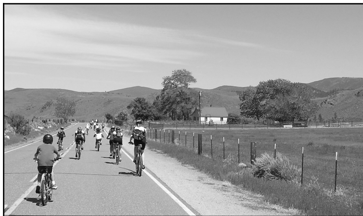
It was a mass start, as kids and their adult escorts started the descent from Diamond Valley School.