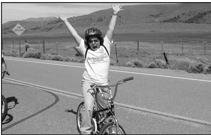
Elation at the turn-around point