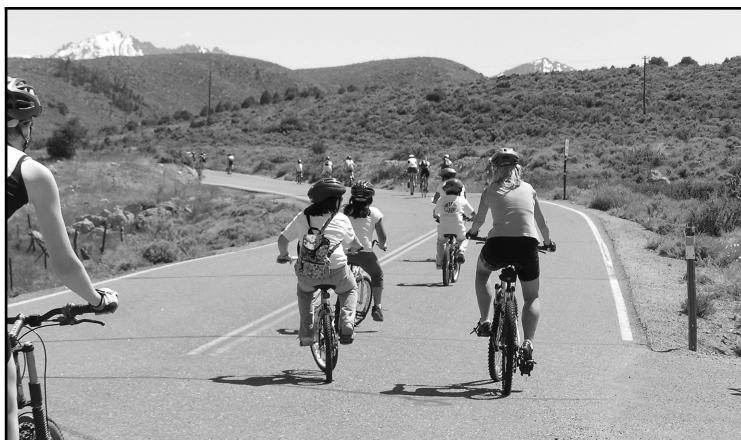
Now the tough part - riding UP the hill back to the school. At least there was a BBQ lunch awaiting the riders.