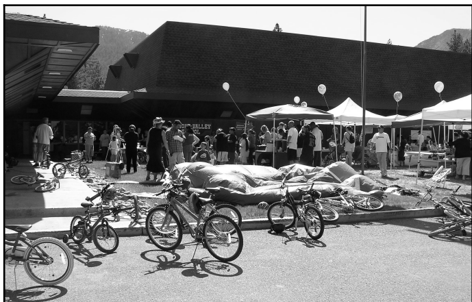
Before the start of the ride, a safety check is performed on each bike.

Club members have been helping out with these bike events for years. Let's get a great turnout of members in our club jerseys this year to help get these kids out on their bikes!