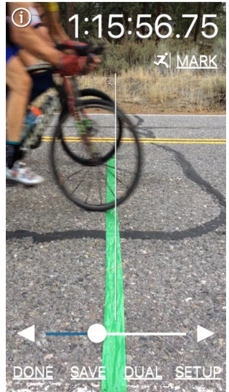
Photo Finish at Diamond Valley